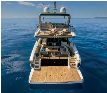
The cockpit is visually connected to the large swim platform, which is 5m wide and 2m deep

The Absolute 60 Fly continues the inland shipyard's tradition of engineering for comfort, performance and quality of life at sea. Starting from a beach platform that's over 2m long and almost 5m wide, you can sense the 60 Fly is going to have what it takes to make a great vacation.