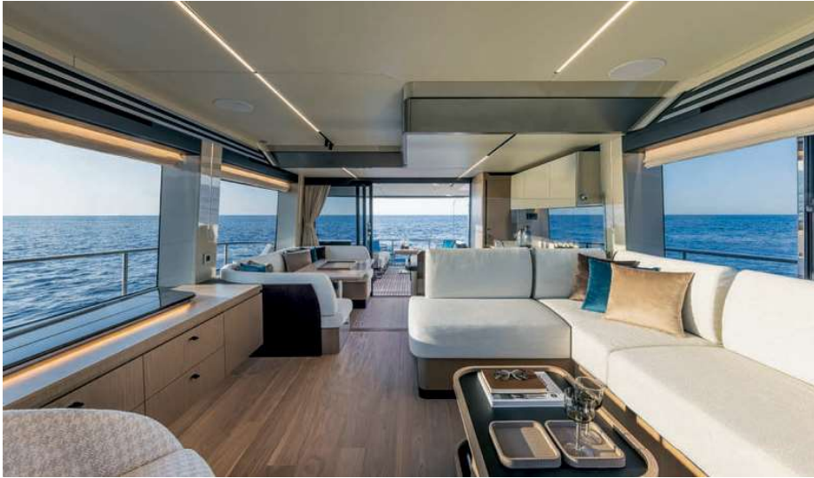
Aft view from the saloon shows the benefits of the clear balustrade in the cockpit, while the huge windows on both sides ensure great views and natural light