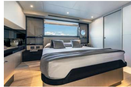
The VIP cabin to starboard features an inward-facing bed and en-suite bathroom aft

family might want. An additional twin cabin has a bathroom that can also be used as a day head.