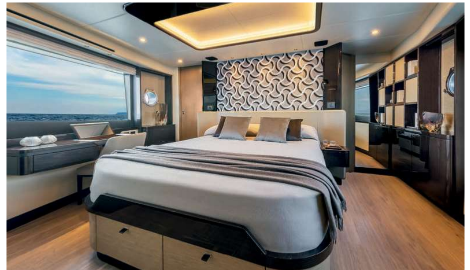
Situated forward on the lower deck, the elegant master suite has enormous windows, a dressing table to starboard and en-suite bathroom in the bow