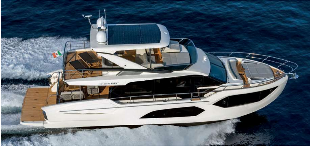
Solar panels have been fitted on the roof of the hardtop on hull one of the Absolute 60 Fly, a model that offers solar power as an option

You've got to hand it to them: the team at Absolute Yachts never rests. Just about a year after launching their Navetta 64, they're at it again with the new 60 Fly, one of the Italian builder's two world premieres at Cannes Yachting Festival. While the volume-maximising lines that characterise the shipyard's look remain the same, there are lots of pleasant surprises aboard this new yacht. And one of them is completely intangible.