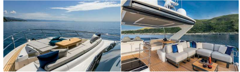
The foredeck (left) has a sofa, table and flexible sunpads; the flybridge (right) has a covered dining area, helm, banquette and sunpads forward, while the aft area is free for loose furniture

Under the hardtop there's a bar with a sink and grill to port and a U-shaped couch with an inlaid teak dining table to starboard. The helming area is convivial, with two seats by the wheel, sun pads right next to it and a banquette across the way. This is clearly a boat that is a pleasure to use in company.