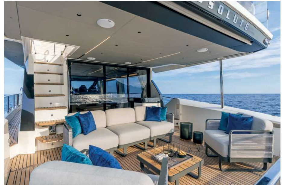
The cockpit is clear of fixtures, so modular furniture can be arranged how an owner wishes, with the option of seating facing aft and enjoying views through the clear balustrade

"With this setup you can enjoy time at anchor in total silence with zero emissions, a real plus."