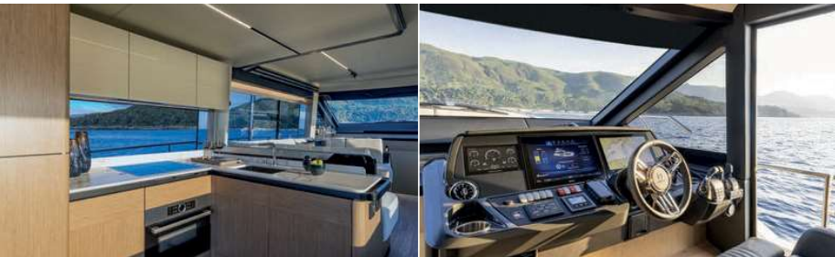
The aft galley (left) to port also enjoys good views and is opposite a dining table; the main-deck helm (right) benefits from having a side door

The en-suite VIP amidships is just as elegant and well-appointed as the master. Intriguingly, a secret door at the back of its large closet conceals... a large storage space. Built where Absolute used to place a twin cabin, this space can be used for provisions, extra toys and equipment or anything else a seafaring