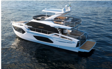
Huge hull and deck windows are the defining feature of the new Absolute 56 Fly