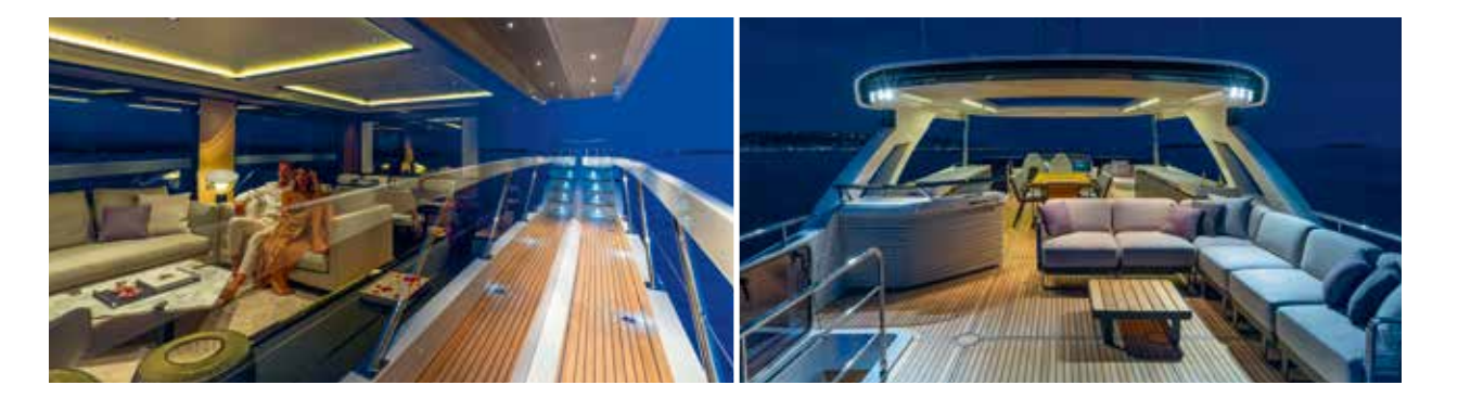
ABOVE LEFT: Whether you're inside or outside, the full-height glazing with open bulwarks looks superb ABOVE RIGHT: The scale of the flybridge has to be seen to be fully appreciated

Whatever you choose, it's clear that in spite of all the 75's wideopen leisure-friendly deck space, this new flagship remains firmly in command of guest privacy too. The aft crew quarters, for instance, are connected by a wide sheltered side deck to the galley's port door. This in turn is connected both to the lower helm and, by means of an internal forward staircase, to the upper helm. This enables the crew to move between the accommodation and the various service and operational zones without ever having to inconvenience the guests. And if you choose a life of self-drive cruising, as many will, it's good to see that crew-centric features like the forward staircase and the push-button privacy panel at the galley retain plenty of recreational merit in their own right.