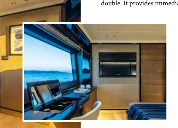
LEFT: The forward owner's cabin is bright. private and beautifully finished